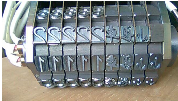
Car rental industry