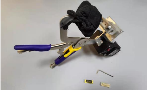
Tire date brander