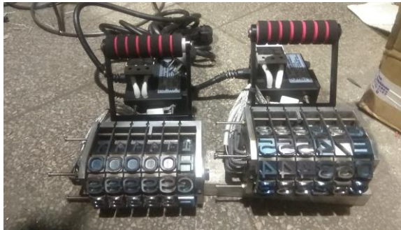
The rubber industry