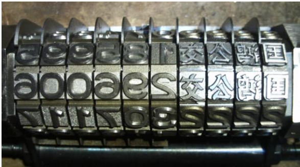
Public Transport Industry