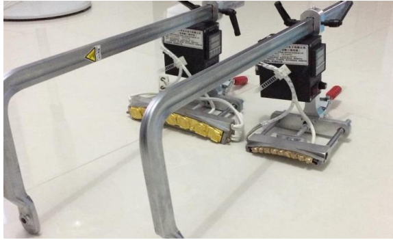
Long arm tyre brander